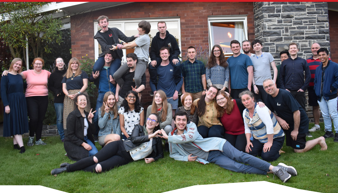
Students from the Canterbury Christian Union